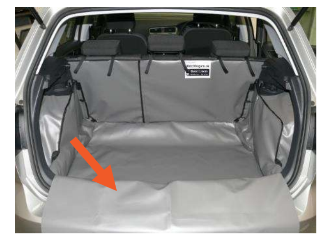
Please note not all of the photographs are specific to your vehicle

Please ensure it does not obstruct the seatbelts when using them.